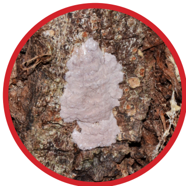
Egg masses (Sept.-June)

WE NEED YOUR HELP TO STOP IT BEFORE IT BECOMES ESTABLISHED