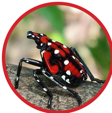
Late nymphs (July-Sept.)