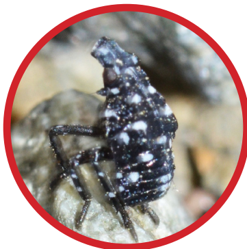
Early nymphs (April-July)