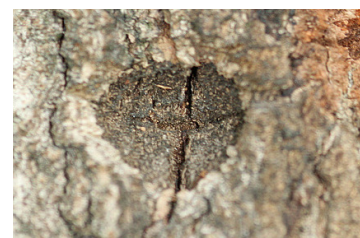
Fresh oviposition pit (top) and older pit that has begun to heal over (bottom).

Report any suspicious tree damage to http://massnrc.org/pests/alb