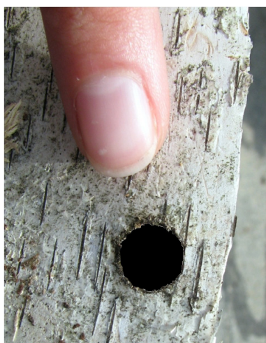
Exit hole in birch, approx. actual size.