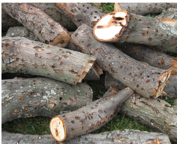
Wood from a heavily infested maple tree in Worcester, MA, with numerous exit holes and egg-laying sites.

In summer, keep an eye out for adult beetles (shiny black with white spots), and for fresh egg-laying sites with sap weeping from them. If you see sawdust-like wood shavings in the crooks of branches or around the base of the tree, check the upper branches for exit holes or egg-laying sites.